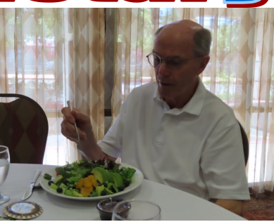
Avocados galore in this salad!